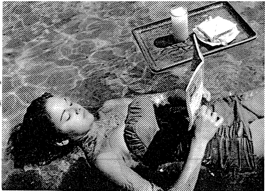
Float effortlessly in the 87°, healing mineral water. Ideal conditions for hydro-therapy — an obvious reason why Ponce de Leon believed this to be a youth restoring spring.

While no medical records of cures are available, I personally know of a number of people who declare that they have obtained relief from rheumatism, arthritis and neuritis by bathing in its waters and drinking them. One man makes an annual pilgrimage to lose weight and declares he has lost as much as forty pounds in a winter season, during which time he bathes in the spring and drinks its waters. Another declares he lost a pound per day.